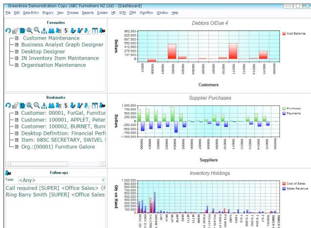
Workflow desks provide immediate answers

When using the many CRM modules, a number of specific Desktop Objects are appropriate and can be added to your desktops including open communications, sales leads, quotations, appointments, sales follow-ups and Most Recently Used functions.